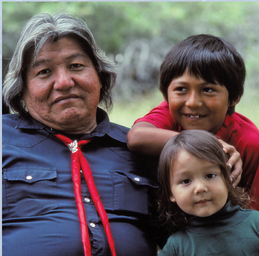
Elders can help protect children from the dangers of secondhand smoke.